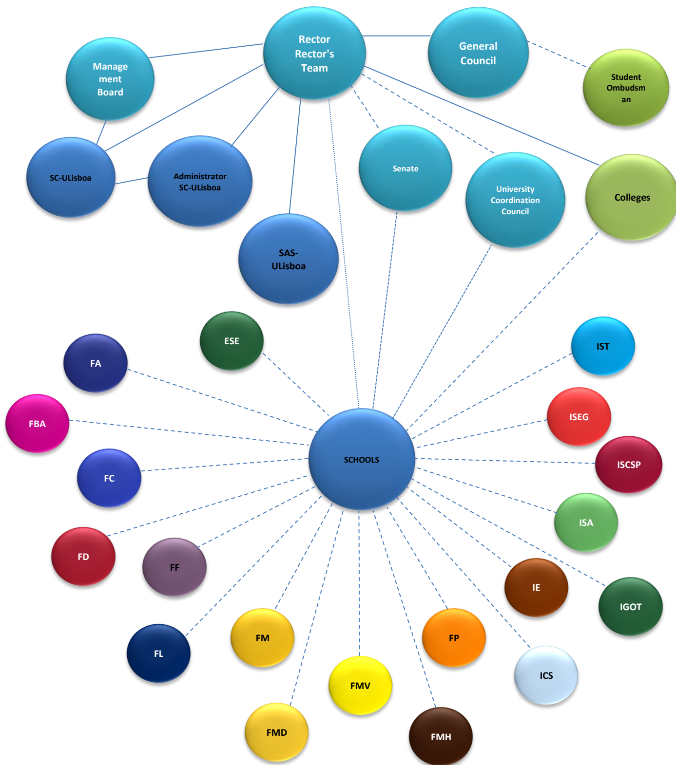
Figure 1 – ULisboa organisational chart